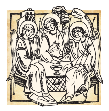
First Day: Friday Gospel of John 14:1–11