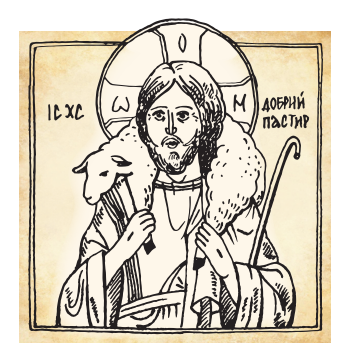
Ninth Day: Saturday Gospel of John 21:15–25